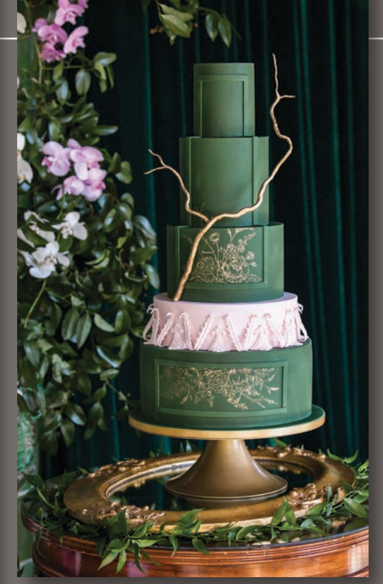
CREATIVE CAKES FOR ALL OCCASIONS