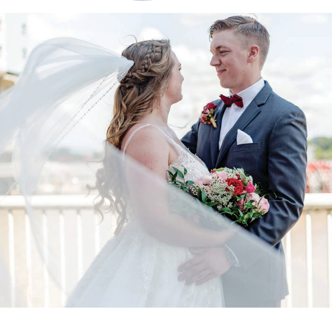
Wedding Planning Guide