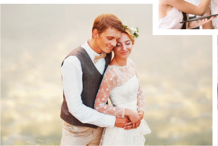
Photo sessions of the newly engaged couple are a wonderful way to announce an engagement and can be used for Save-the-Dates, wedding invitations, guest books and home décor.